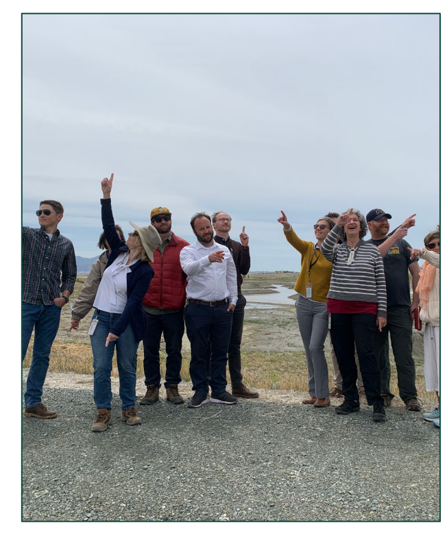
Sustainability Exchange tour of Lower Walnut Creek restoration project, May 2022.