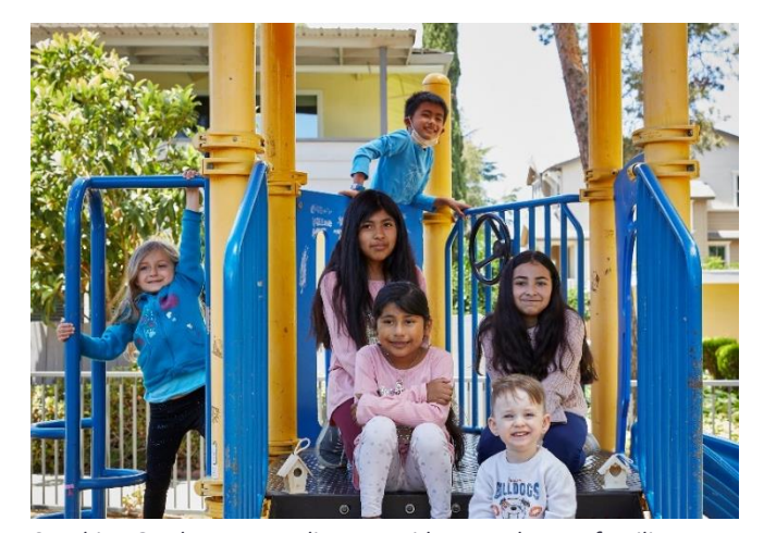
Sunshine Gardens serves diverse residents and many families

Interested property owners can learn more and get started by visiting www.bayren.org/multifamily or calling (855) 213-2838.