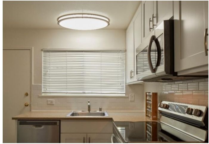
A renovated kitchen with LED lighting, low flow water fixture, and an induction cooktop

Deborah was very impressed with the entire process, noting that "Sebastian was able to think big picture and provide a scope that fit our management's requirements, while also being able to dive into the nitty gritty of individual measures." After AEA helped the management team identify a qualified contractor, the property ultimately installed insulation in the attic, upgraded all exterior lighting to LEDs, and upgraded the pool pump to a more efficient ENERGY STAR model, all of which was made financially feasible with a $33,000 rebate through the BAMBE program.