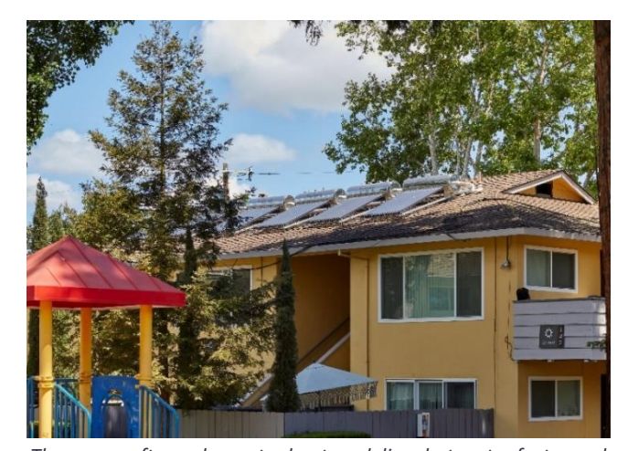
The new rooftop solar water heaters deliver hot water faster and improves the efficiency of the existing gas water heaters