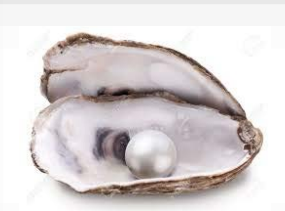
SEEC – A grain of sand in Local Governments' sustainability oyster